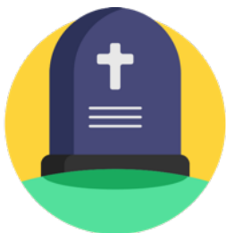
death of a family member