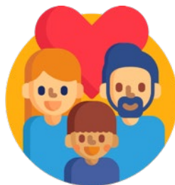
loss of parental coverage