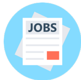
spouse gains or loses coverage